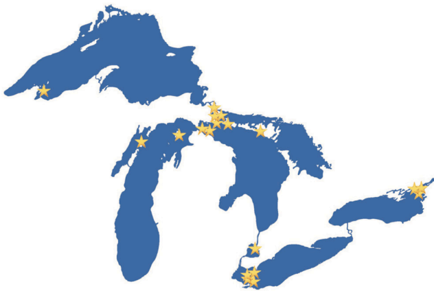
Approximate location of 20 GLIA Member Islands

The Great Lakes Islands Alliance (GLIA), a bi-national network of island communities, is the only entity in the Great Lakes region dedicated solely to the unique needs of island communities. The summit will bring together 75+ islanders to discuss the challenges and opportunities associated with island living. Participants will include non-profit leaders, business owners, Chambers of Commerce, visitors bureaus, local elected officials, educators, island boards and committees, property owners, and more.