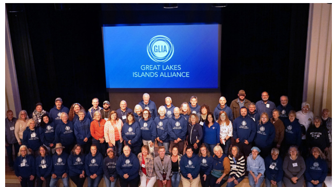
Participants in the 2025 Summit at Beaver Island