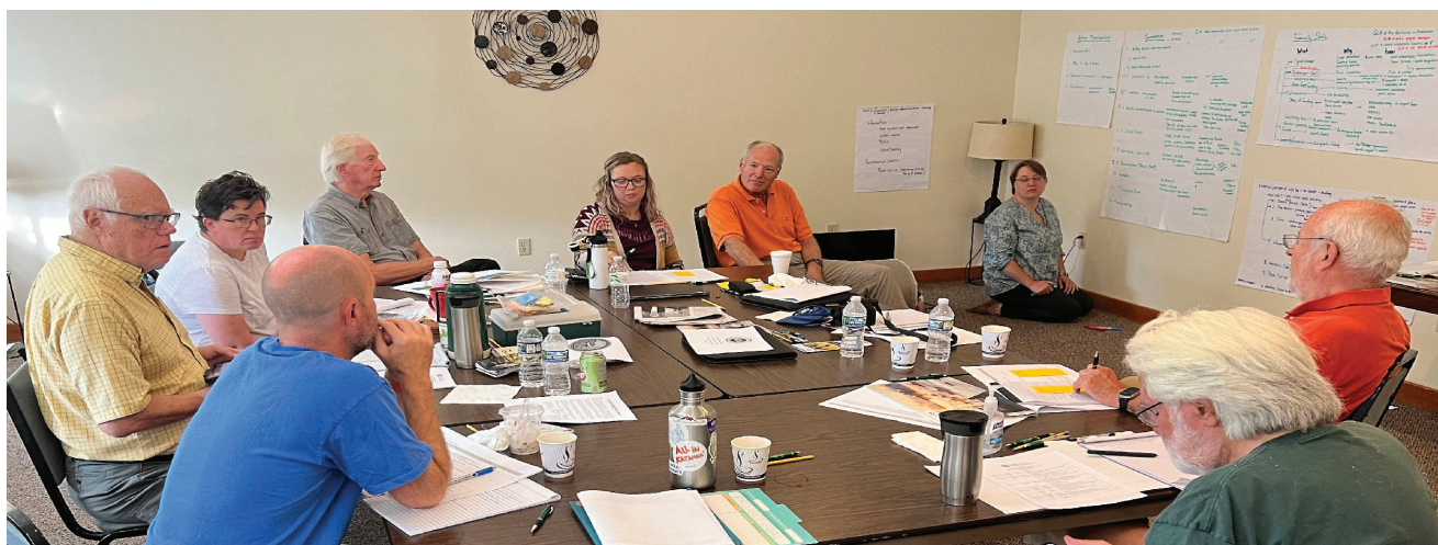
Work session at the 2023 strategic planning retreat.