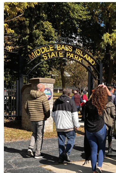
2022 GLIA Summit participants on Middle Bass Island