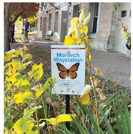
Visiting a Monarch Waystation on Gibraltar Island During the Summit