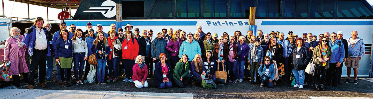
Participants at our 2022 Islands Summit at South Bass Island, Ohio

In 2022, the Great Lakes Islands Alliance (GLIA) saw a return to “normal” and was again successful in meeting our goals for the year, as described below. After a two-year hiatus, we held our highly anticipated Great Lakes Islands Summit on the Lake Erie Islands, featuring visits to five islands in four days. The return of this event and opportunity to meet in person reminded islanders how much we have in common. This event, together with our monthly meetings and other activities throughout the year, are reinforcing the value of connecting island communities. GLIA’s role is to help create and foster these relationships and those with mainland decision-makers. We look forward to 2023 as we grow our impact.