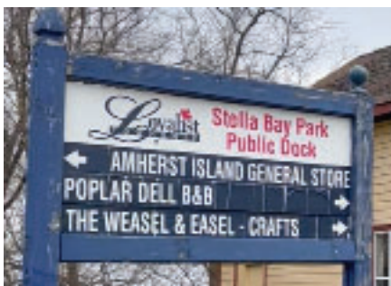
Amherst Island, Ontario is the newest GLIA member and joined in 2022

“The recent GLIA summit was one of the highlights of my life. I could never thank you enough for the wonderful, all round educationally stimulating experience”.