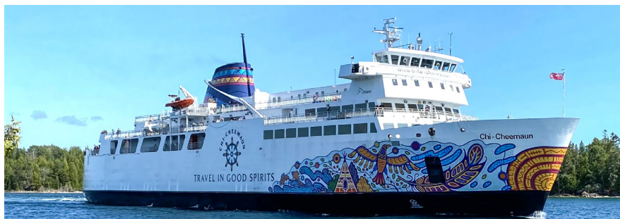
Mnidoon Mnising (Manitoulin Island), served by this ferry, is a gateway into the very heart of Canada. Pristine wilderness stretches across the island while a spirit of camaraderie is shared by First Nations peoples, non-native residents and visitors alike.