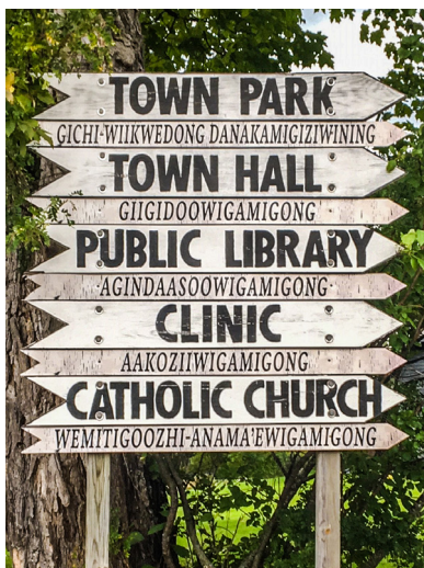
A multi-lingual sign in English and Ojibwe on Madeline Island, WI

GLIA continues to make steady progress towards its mission and goals. Below is a snapshot of our major accomplishments in 2021.