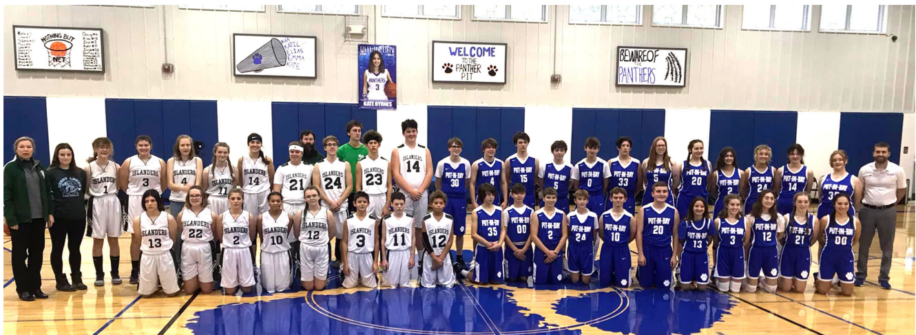
The Put-in-Bay Panthers and Beaver Island Islanders at Put-in-Bay in December, 2021