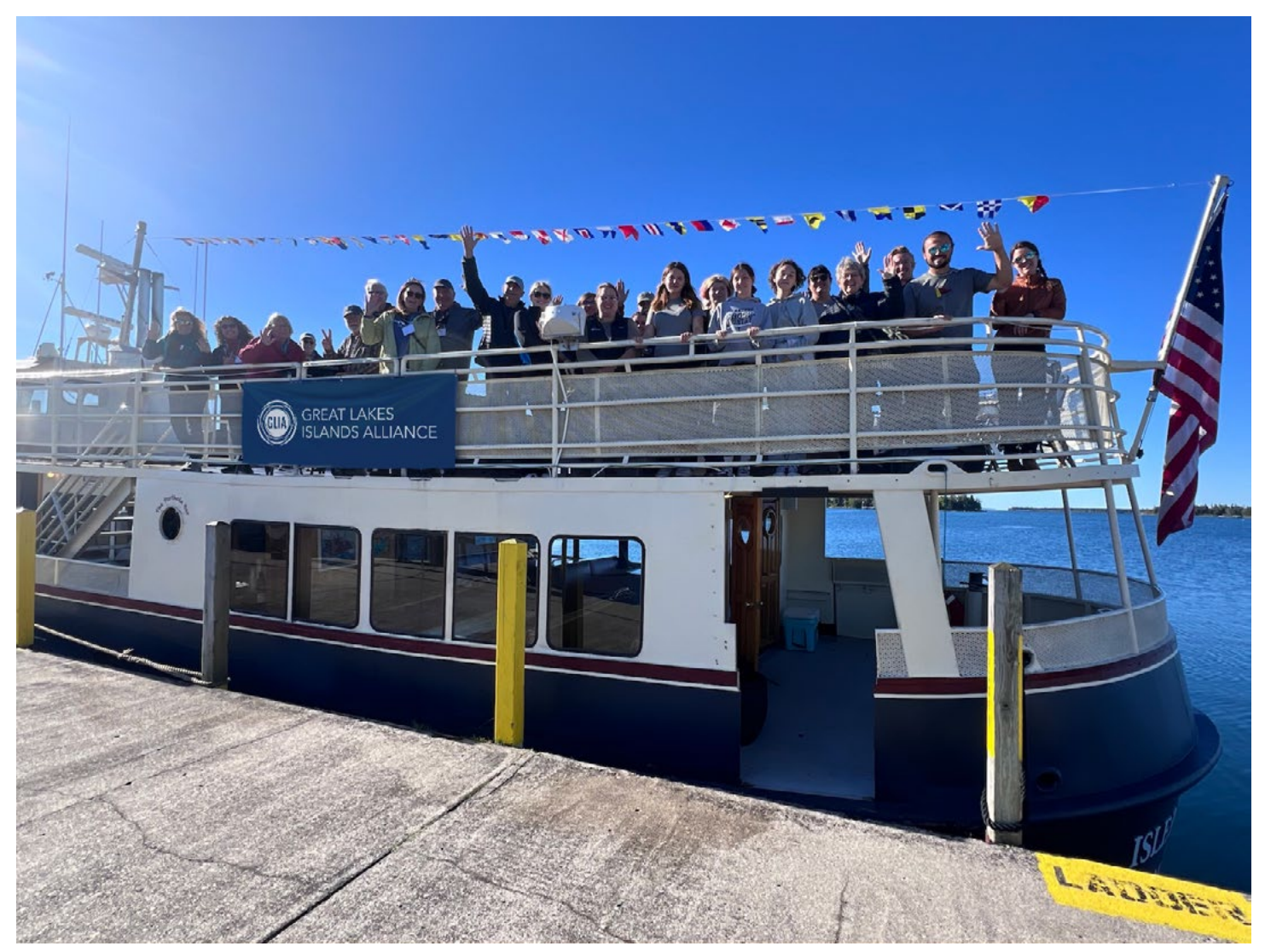
2024 Great Lakes Island Summit attendees aboard the Isle Royale Queen III embarking on a tour of Les Cheneaux Islands.

With the notion of cycles in mind, GLIA will use the New Year to look back again and reflect on what we have achieved together. With the completion of 2024, GLIA now has six full years under its belt. We hope you join us in being proud of our growth and impact. The accomplishments listed below are the product of many people. Being part of GLIA means you have a connection to over 200 (and growing) islanders. That is powerful and a testament to what we can achieve together into the future.