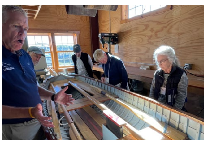
GLIA members had the opportunity to tour the Great Lakes Boat Building School in Cedarville, MI, during the 2024 Islands Summit.